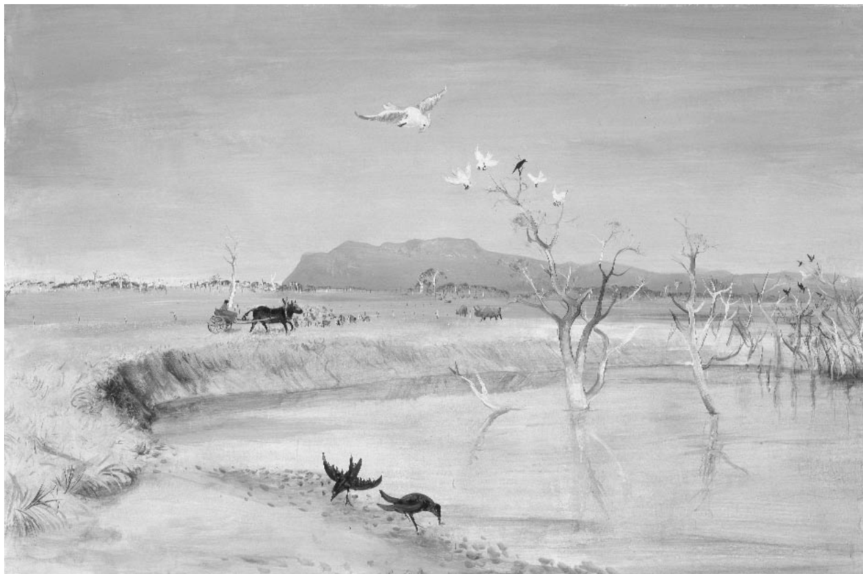
Arthur Boyd (1920–1999 Australia), Irrigation lake, Wimmera , 1950. Resin and temera on composition board, 81,4 x 121.9 cm, purchased 1950. Arthur Boyd's work reproduced with the permission of the Bundanoon trust, courtesy of the National Gallery of Victoria.